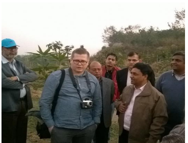
Team from Finland visiting Kusunda, Dec 2016