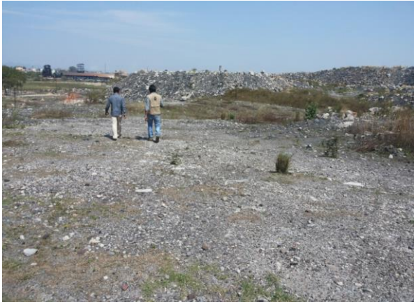
NAK, Govindpur Area site before Ecological restoration