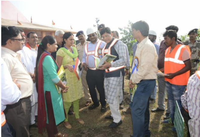
Visit of Hon'ble Minister of Railways and Coal to Gokul Eco-cultural Park, Lodna, 2018

The Ecological restoration works being done by BCCL on mined out degraded lands has been visited, reviewed and appreciated by various dignitaries and organizations of national and international levels and recommended for adoption of Ecological Restoration as a means for restoration of degraded lands. Some of the glimpses are as below: