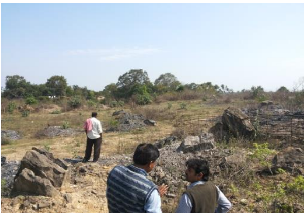
Murulidih, WJ Area site before Ecological restoration