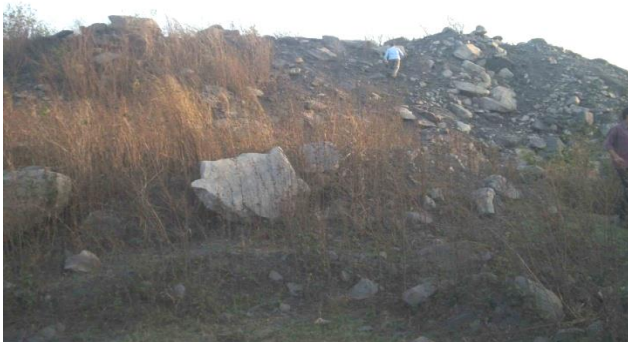
Tetulmari, Sijua Area site before Ecological restoration