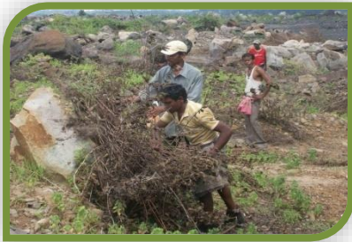
Fencing and Weeds removal