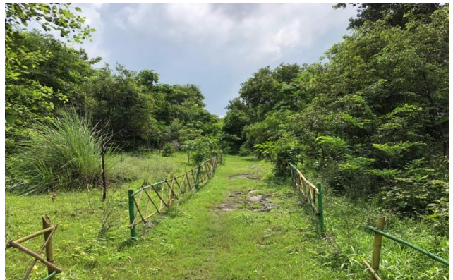
Tetulmari, Sijua Area site After Ecological restoration