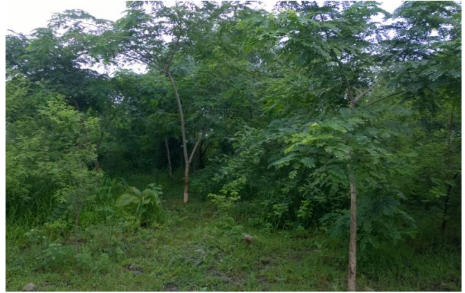
NAK, Govindpur Area site after Ecological restoration