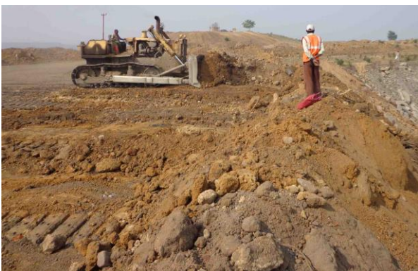
Gokul Eco-cultural cum Tourism Park, Lodna Area before Eco-cultural restoration