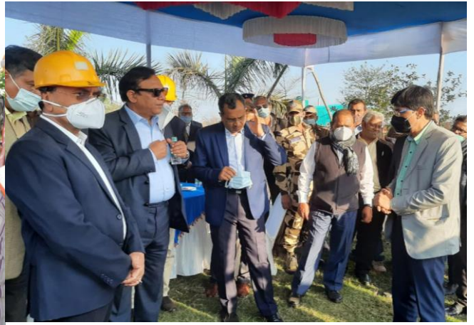
Visit of CMD, BCCL to Gokul Eco-cultural Park, Lodna, 2021