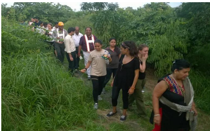
Team from South Florida University, USA at Gokul Eco-cultural Park, Lodna, 2017