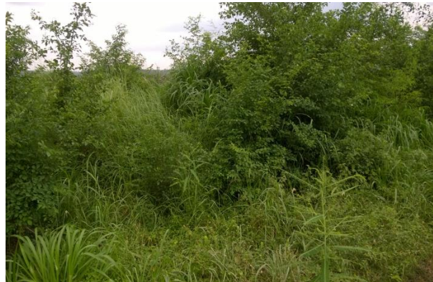
ROCP, Bastacola Area site after Ecological restoration