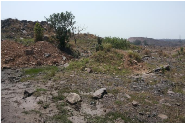
ROCP, Bastacola Area site before Ecological restoration