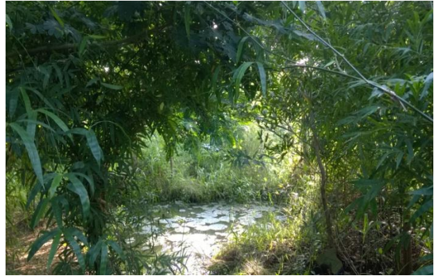
Damoda, Barora Area site after Ecological restoration