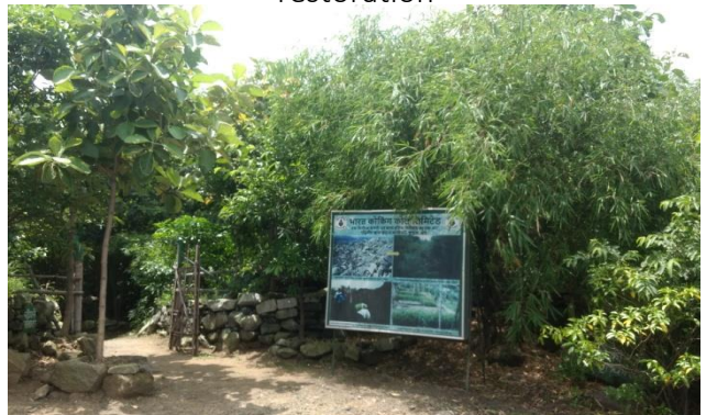
GKKC Kusunda Area site after Ecological restoration