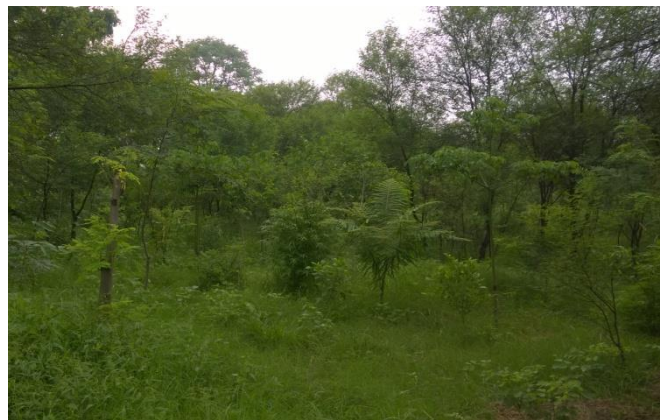
Murulidih, WJ Area site after Ecological restoration