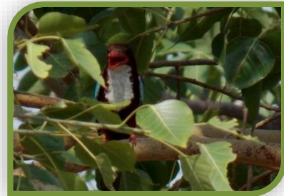
Establishment of biodiversity