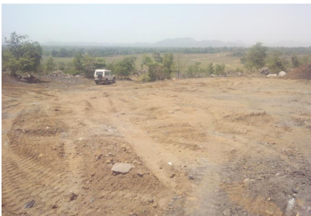
AKWMC Katras Area site before Ecological restoration