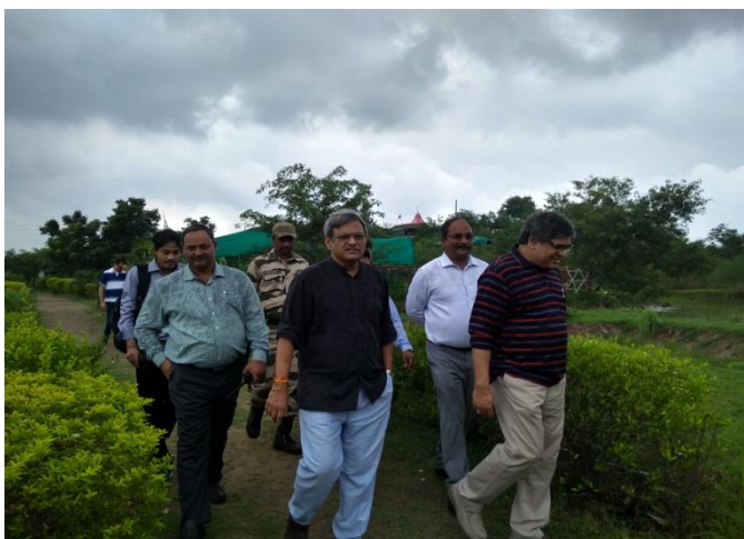
Visit of Director, IIT-ISM, Dhanbad to Gokul Eco-cultural Park, Lodna, 2018