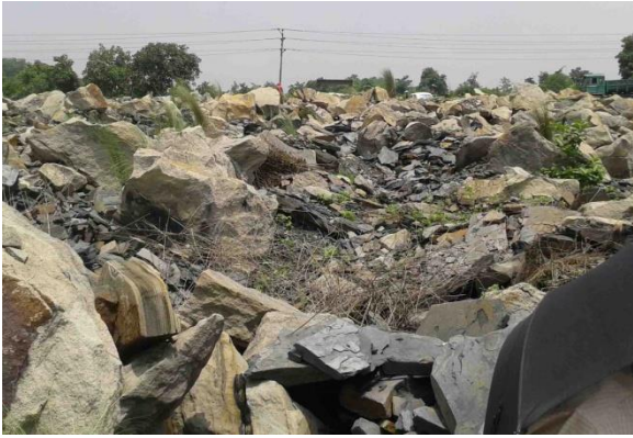
Damoda, Barora Area site before Ecological restoration