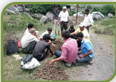
Grass Seed balls