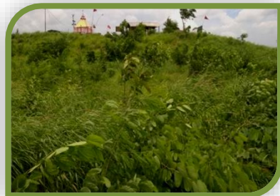
Establishment of 3-tier ecological restoration system