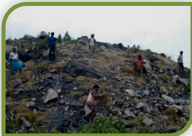
Mulching with dry grass over slopes