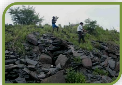
Seed balls broadcasting