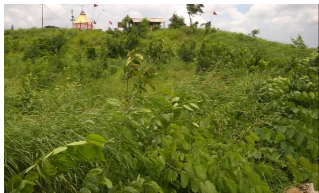
Gokul Eco-cultural cum Tourism Park, Lodna Area after Eco-cultural restoration