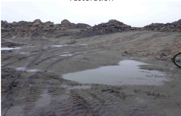
GKKC Kusunda Area site before Ecological restoration